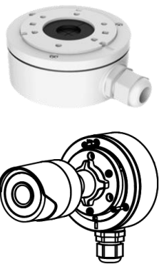
DS-1280ZJ-XS Junction Box